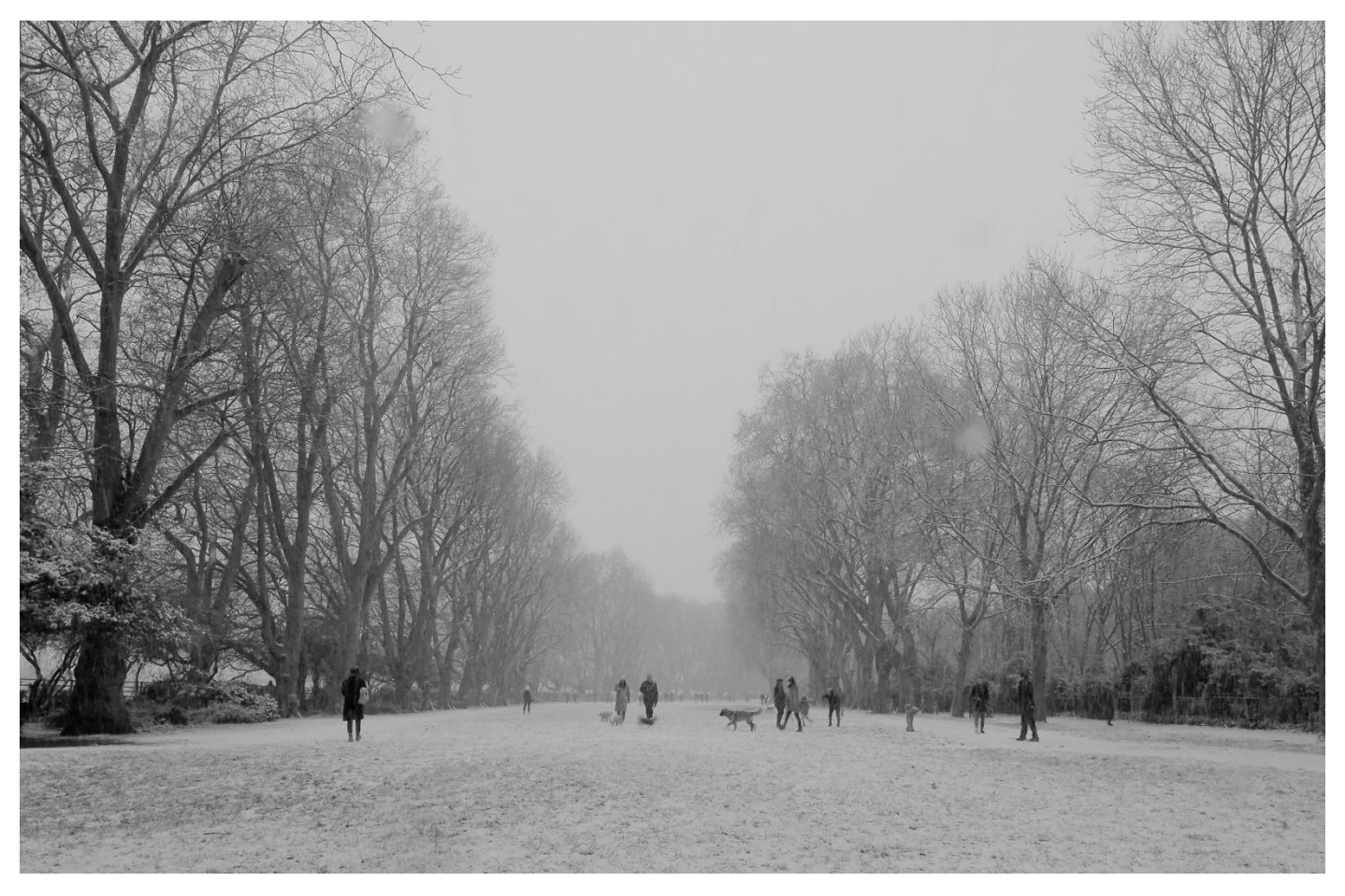
1 Snow making the park look like a winter wonderland.